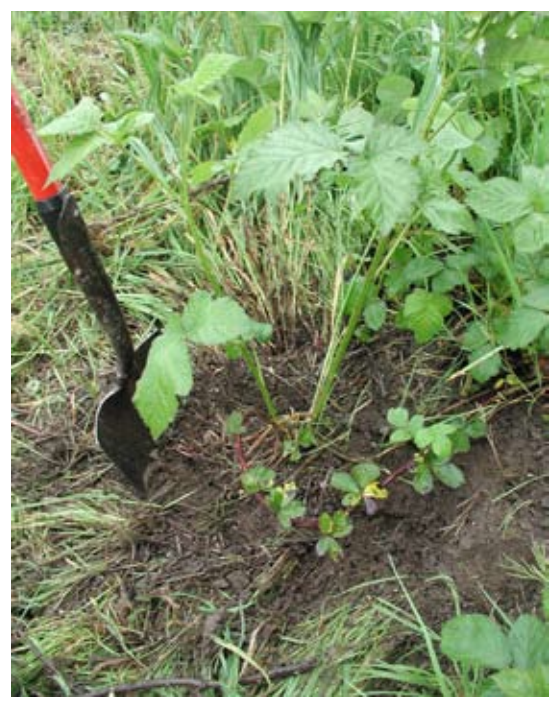
Figure 4.—A new blackberry cane, called a "daughter" plant, can root where another cane's tip or nodes touch the ground.

4. Maintenance treatments to reduce or eliminate competing vegetation surrounding desirable native vegetation.