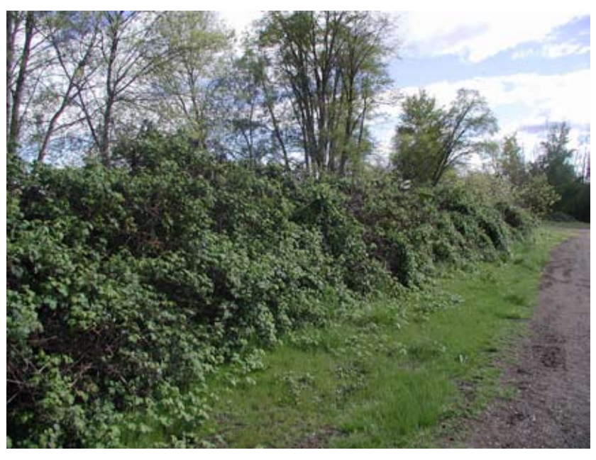
Figure 1.—If the Himalayan blackberry shown here is not checked, it could crowd out the existing trees and prevent new ones from establishing.

Another significant problem with the dominance of Himalayan blackberry is its effect on the development of streamside vegetation over time. Because of the intense competition for light, moisture, and other resources in Himalayan blackberry thickets, few new trees and shrubs can become established. Those that do are mainly root suckers of established plants. As short-lived riparian trees such as alder and black cottonwood die, they will not be replaced with younger trees (Figure 1). Thus many tree-covered riparian zones may be in danger of turning into shrub fields dominated by Himalayan blackberry.