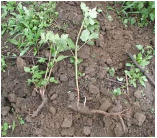
Figure 2 (at far left).—A root crown, or "burl," of Himalayan blackberry. Many stout lateral roots and smaller, fibrous roots could have emerged from

Figure 3 (at left).—Shoots can emerge from black-berry roots and root crowns at depths up to 18 inches.