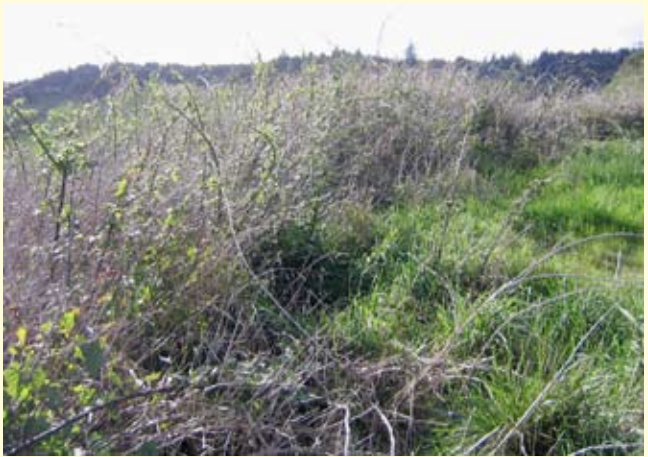
At top left, spores of the blackberry leaf fungus and (top right) the leaf spots that signal infection. Above, blackberry defoliated by the fungus.

on the most rust-resistant plants so they don't spread at the expense of more susceptible varieties. Since new information about the rust is emerging rapidly, riparian practitioners should consult with the Oregon Department of Agriculture or local experts before beginning blackberry control projects in areas where the rust is present.