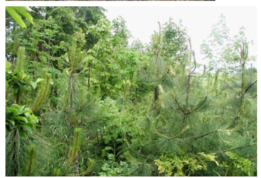
Figures 5, 6, and 7.—An example of replacing Himalayan blackberry with native trees. Site preparation included two mowings and an autumn application of glyphosate, made with a backpack sprayer. Postplanting treatments included spring spot-spraying with glyphosate and hand weeding. At top, the initial mowing, in May 2000. The Himalayan blackberry thicket was 4 to 8 feet tall on a terrace above Jackson Creek, adjacent to a farm field. Figure 6, center, is the same site in autumn 2001, after the first growing season. Note white alder and Oregon ash in the background. Species planted included ponderosa pine, bigleaf maple, Oregon ash, and Oregon white oak. Himalayan blackberry cover is minimal; competing vegetation is dominated by thistles and poison hemlock. Figure 7, bottom, is the site in spring 2005 from the same photopoint. Trees are well above competing vegetation and capable of dominating the site. Grasses have invaded the plot from the adjacent field; Himalayan blackberry is scarce within the treated area but is invading from the sides (the "edge effect").