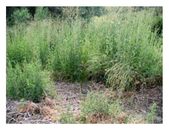
Figure 9.—A dense growth of thistles has invaded this site, initially a 6-foot-tall Himalayan blackberry thicket that was hand slashed and then grubbed to remove root crowns and

goats probably are best suited for Himalayan blackberry control in upland areas when: