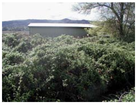
Figure 11.— Two seasons after cutting back Himalayan blackberry (at right), sandbar willow (Salix exigua, below) is making a good recovery on the site.

Young seedlings can be hoed easily when their roots systems are not well established.