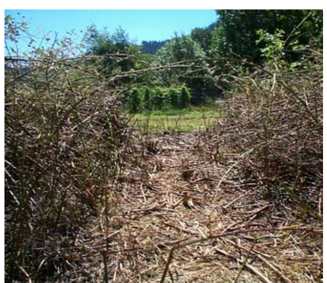
Figure 8.— Goats will eat succulent green leaves and canes of Himalayan blackberry but not dead, woody canes. Blackberry regrows rapidly after the goats leave the site.

Prescribed fire Burn either untreated thickets or mowed or cut areas that have regrown. During spring and summer, blackberry plant moisture content is high. It is lower in late fall and winter and may be easier to burn then. Note that burning permits are required in most localities, and other rules might apply; contact your municipal or county government for information.